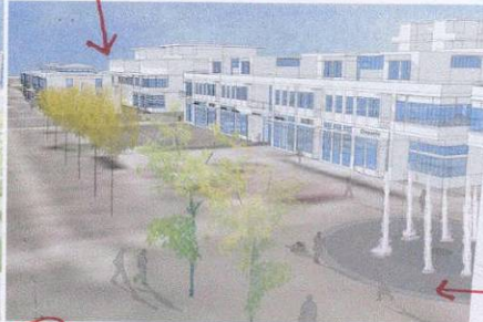
Looking south towards the new plaza from 4th and Birch