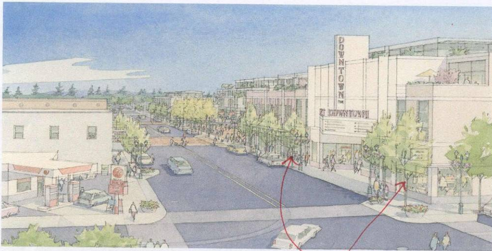
New development to the south of 3rd Avenue, seen from 3rd and Adams

IF THEATRE - THEN IMPORTANT TO FLANK IT W/ SMALL SCALE RETAIL SHOPS